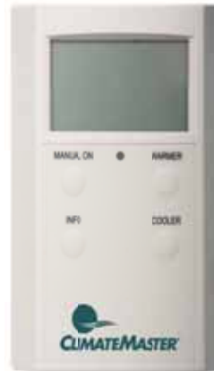
Figure 2: ASW15 sensor shown

Local setpoint adjustment (ASW14 & ASW15)