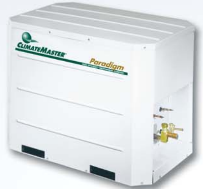
Paradigm Series Unit

The innovative design of the Paradigm offers a variety of cost saving installation options available for the first time with a geothermal system. This unique engineering allows the unit to be installed outside, using your current system connections without changes or special modifications. Just add a ground loop, and you are in business.