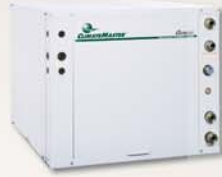
Genesis Split Unit

The Genesis Split Series Units can be easily connected to your existing furnace or installed with a new Air Handler from your ClimateMaster dealer to heat and cool your entire home quietly, efficiently, and economically. Easily connected to fossil fuel or electric furnaces, the Genesis Split is ideal for "add-on" installations, providing you with the maximum in convenience and comfort at a reduced installed cost.