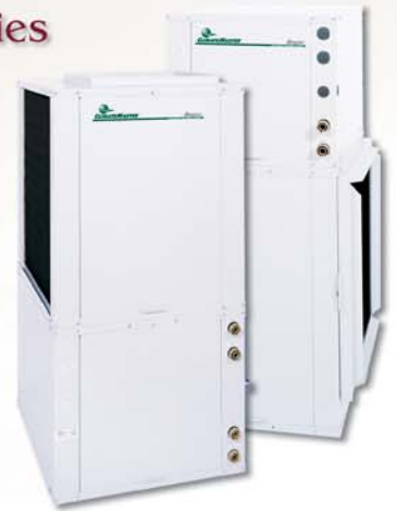
Genesis Packaged Upflow & Downflow Units

Flexibility: A wide range of sizes and configurations make the Genesis Packaged product line appropriate in nearly any residential application.